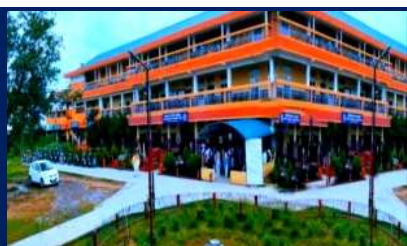
Jorhat Kendriya Mahavidyalaya